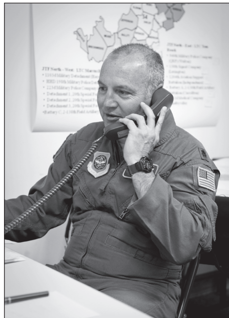
Joint Task Force Cardinal officials receive a status update of relief operations at the Kentucky Air National Guard Base on Aug. 5.